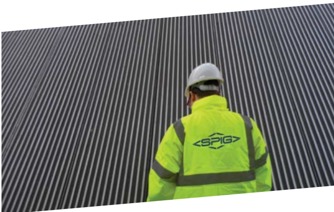
Single-row tube Air-Cooled Condenser