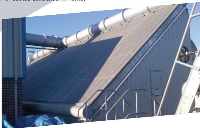
\Delta -Frame design