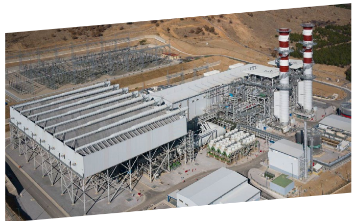
Air-Cooled Condenser and Air-Fin Cooler in Turkey

SPIG® provides flexible, customized technical solutions to satisfy most any customer requirement.