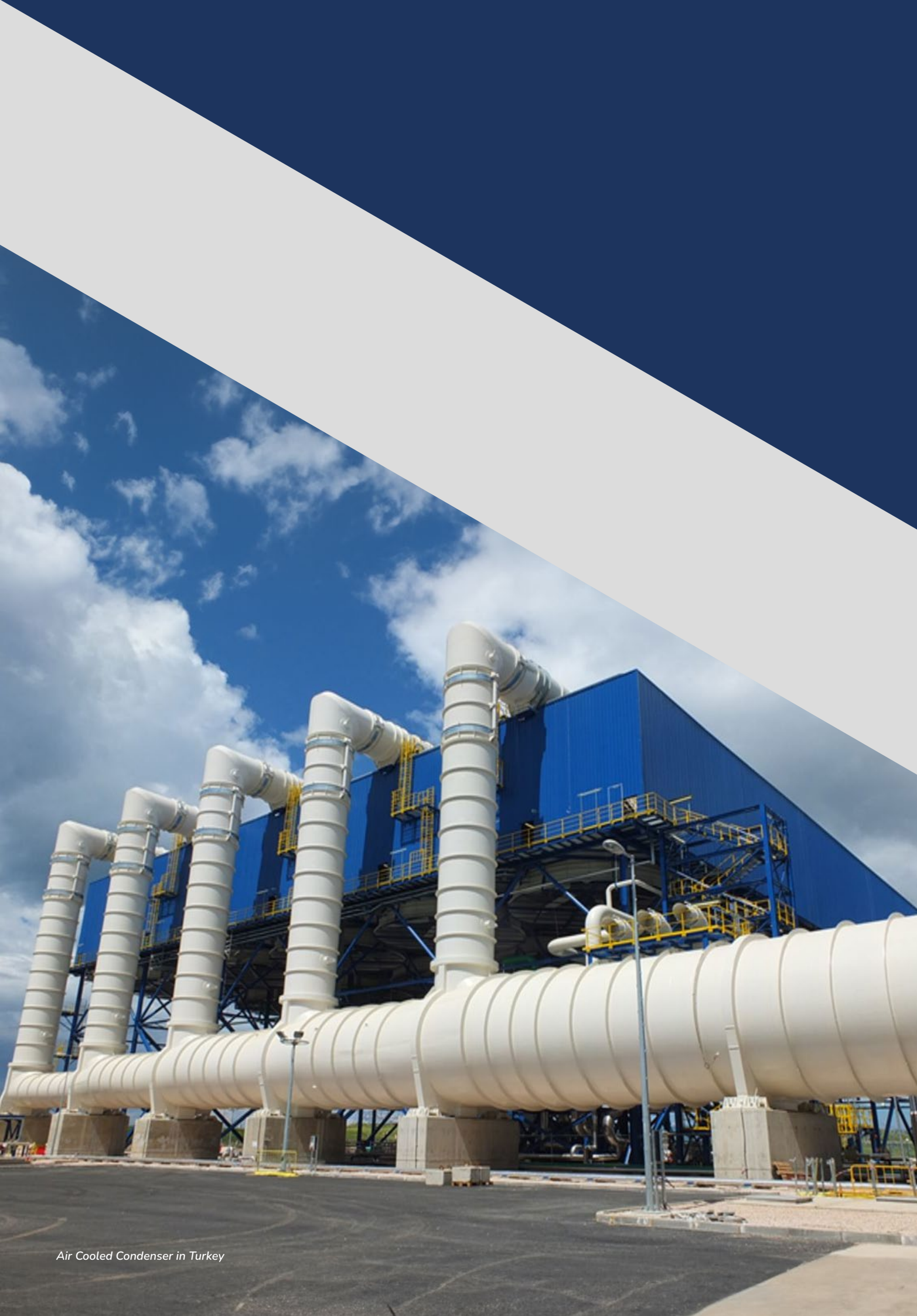
Air Cooled Condenser in Turkey