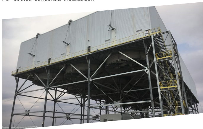
Air-Cooled Condenser in South Africa