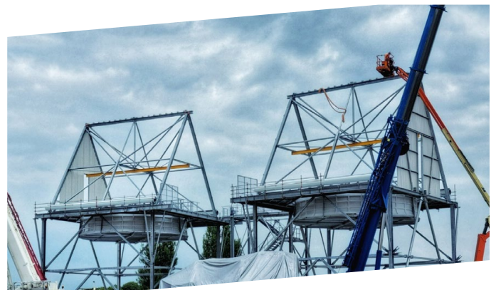
Air-Cooled Condenser installation in UK