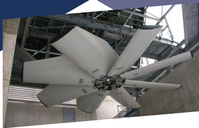
Air-Cooled Condenser installation