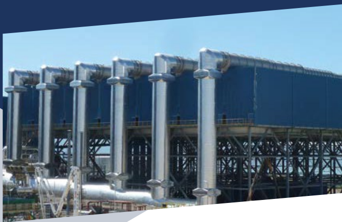
Air-Cooled Condenser in Turkey

SPIG specializes in the direct production of single-row bundles from our factory in China, tailored for efficient performance in Air Cooled Condensers.